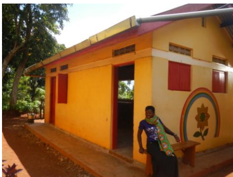
The new lab under reconstruction.

This quarter, 108 children and adults were treated for severe malnutrition and 530 children were vaccinated at the Mother and Child Wellness Center. Also this quarter, 140 Depo-Provera injections for three-month birth control were administered at the Center, 21 women received 3-month packs of birth control pills, and 33 new long-term contraceptive implants were inserted and 37 were removed. Significantly, 33% of this quarter’s Depo-Provera users were new users, 43% of the women who chose Pilplan were new, and 79% of those who chose contraceptive implants were also new users. No IUDs were inserted, five were removed and 7,628 male condoms and 70 female condoms were distributed. Seven women were counseled about side effects they were experiencing from birth control use.