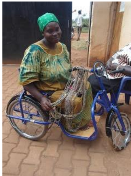
This year we also distributed hand-operated tricycles, which had been specifically requested by disabled recipients.