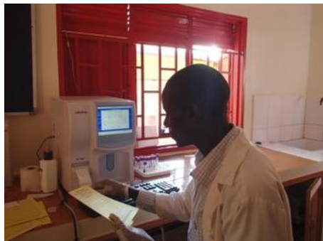
A laboratory technician makes use of the donated CBC machine.

The second quarter continued the busy trend for 2016. At times it's unbelievable that we've gotten so much busier than last year! The first two quarters of 2016 put us on track to see over 30,000 patients at the clinic, and another 20,000 through outreaches. This increased activity has put more pressure on all staff at the clinic as well as our space and ability to treat so many people. So far we have been able to adapt to meet the ever-growing demand, but we are nearing the capacity of the clinic.