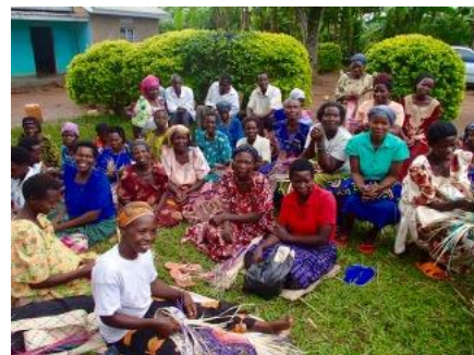
The Super Hole Ladies Cooperative at work weaving mats.

As a complement to the malnutrition education program and the DIG garden program, we have been working with communities to help them develop income generation initiatives as well. When you scratch the surface of the immediate health problems people face, such as malnutrition, you discover how these problems become intractable and keep people in a cycle of poverty. A common theme is a lack of education combined with a lack of income generation. After careful analysis of this problem, we decided to find a way to help communities to help themselves, thereby creating independence and ownership of income. All initiatives come from the communities themselves. Our role is only to link these local groups to people who can help hone their visions into projects that can achieve their goals. For example, in June we helped a group of women in Superhole, one of the local villages in which we have treated high rates of malnutrition and malaria, to start their own cooperative weaving group. The weaving group wrote their own constitution and by-laws in which they clearly stated what they hoped to achieve. For these women, this process is a huge step in helping them to help themselves achieve a sustained income of their own.