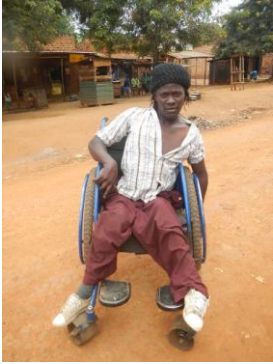
Community member making use of his new wheelchair.

The second quarter of 2014 has been busy and productive for Soft Power Health!