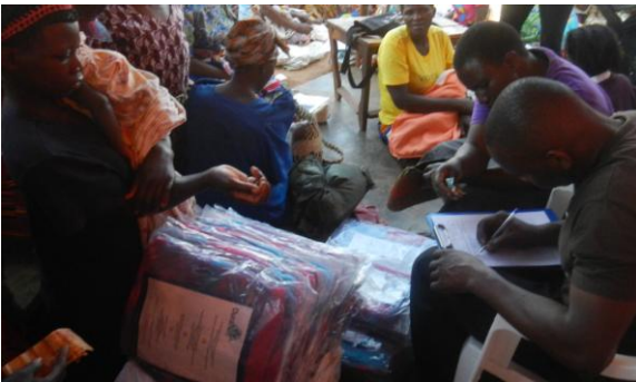
Mosquito net sale after a malaria outreach session.

This quarter, we sold a total of 1,261 mosquito nets through our malaria education and prevention outreach and at the clinic. 626 nets were sold at education outreach sessions at 10 different villages, and 635 were sold at the clinic. The malaria outreach team made 275 follow-up visits to 7 villages to evaluate whether previously purchased nets from education sessions were being used correctly and whether people reported having less malaria. While net sales remain depressed compared to pre-2014 levels, we are pleased at the healthy demand that remains in the communities we serve. Slow and steady wins the race, as my dear old dad used to