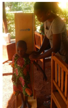
A child is measured as part of the new malnutrition triage protocol.