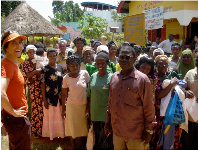
Opening day of the Mother and Child Wellness Center, February 2011.