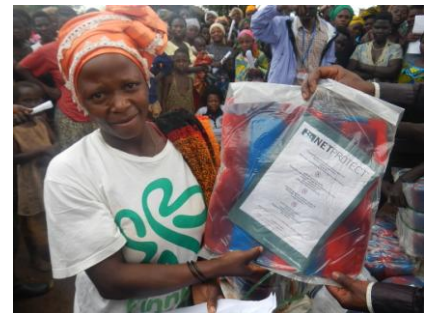
Congolese refugee appreciating her new long lasting insecticide treated net at malaria education session and net sale at the Kyaka II refugee camp.

Despite the fact that the ministry of health in Uganda gave away 15,500,000 free mosquito nets in Uganda this year, Soft Power Health was still able to fill in many gaps that the government missed, including a big trip to a refugee camp in Western Uganda in December 2013. This year Soft Power Health sold 8,368 mosquito nets across 62 villages in Uganda. In addition, the Soft Power Health malaria team made 1,125 follow up visits to net buyers' homes to assess net usage and malaria incidence. All of this was accomplished despite having free nets being distributed nearly everywhere in Uganda. Luckily, we are still able to address the needs of people who these government programs miss and who are still interested in truly adopting a behavior change of sleeping under an LLIN every night.