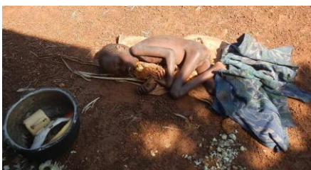
A local child needing treatment for malnutrition.

Since we have not raised any salaries in two years, we now must do it to help people make ends meet with the rising cost of living in Uganda. The salary increase and associated tax increase will cost us an additional $6,000.00 per year.